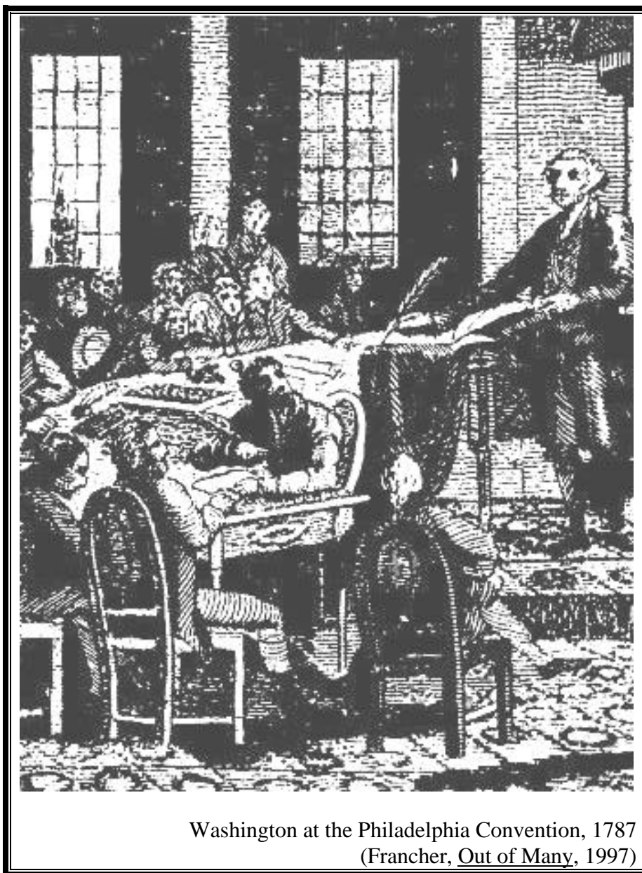
Washington at the Philadelphia Convention, 1787 (Francher, Out of Many , 1997)