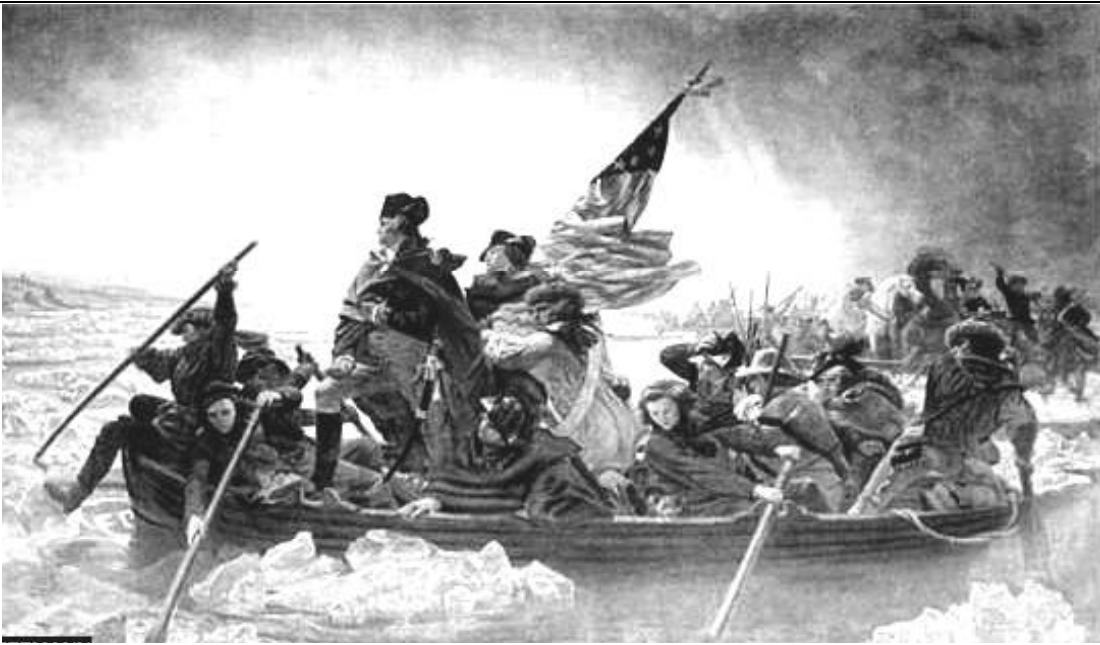
Washington Crossing the Delaware before the Battle of Trenton, 1777